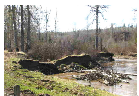
BEFORE: Necoslie River banks annual erosion