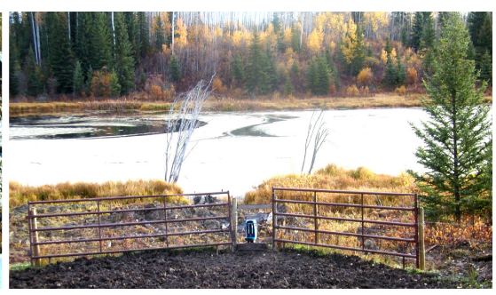
Restricted livestock access to riparian area with a nose pump waterer