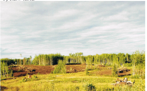
2) Cleared land