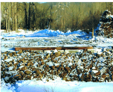
AFTER: Stabilization with rip-rap and logs (frozen Necoslie R. in foreground)