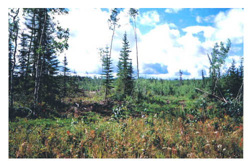
1) Raw land