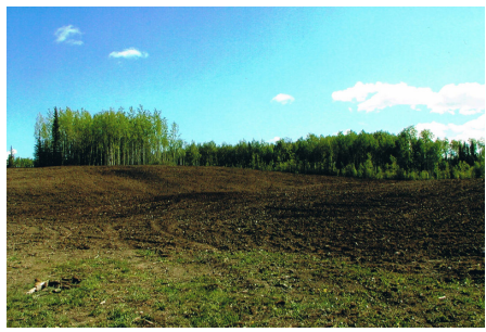
3) Cleared land ready for seed