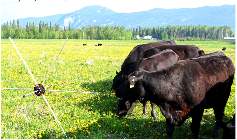
Electric fence used for strip grazing

Canyon Tree's grazing management plan has a focus of environmental sustainability. To achieve this, the grazing systems are a combination of strip grazing and rest-rotational grazing. On the ranch, miles of electric fencing and solar powered electric fencers have been installed. The overall goal is to protect the natural ecosystems while improving grass production and decreasing input costs. Lynn and Harry have found this method leads to better utilization of forage and builds soil health without the use of commercial fertilizers. The grazing method has also helped control invasive plants, such as buttercup and thistle, are almost eliminated from the pastures. Hay fields are not grazed in order to ensure maximum crop yield. Cattle are winter fed on fields that are either scheduled for restoration or need the extra natural fertilizer. In the winter, the ranch uses bale feeders to minimize feed waste.